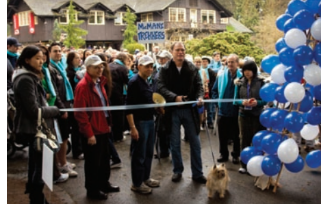
2010 Vancouver Investors Group Walk for Memories at Stanley Park.

It's easy to participate! To learn more about the walk go to www.walkformemories.com . One in three Canadians knows someone with Alzheimer's disease or a related dementia. Who are you walking for?